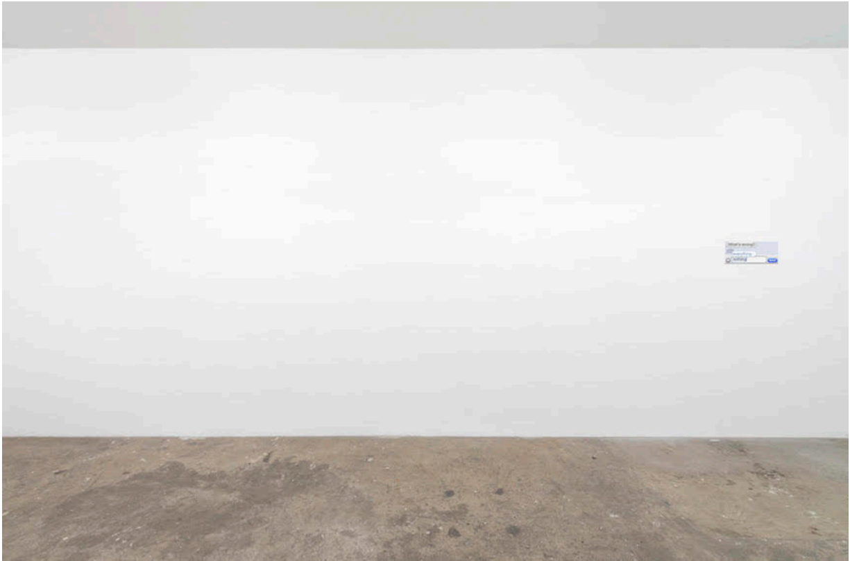
Mike Zahn Todo y Nada , 2020 Portable Network Graphics Image (PNG) 434 KB 864 x 607 RGB Preview (Default)