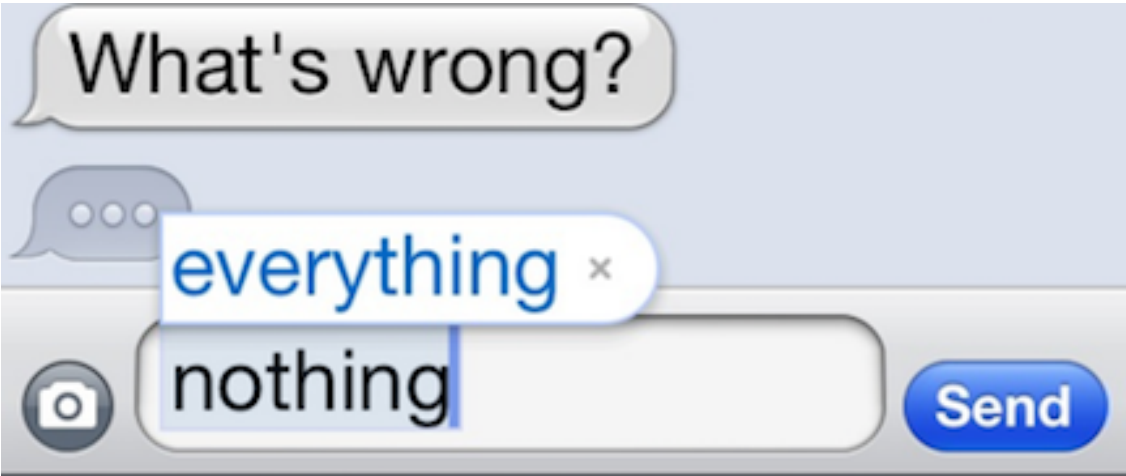
Mike Zahn Todo y Nada , 2020 Portable Network Graphics Image (PNG)