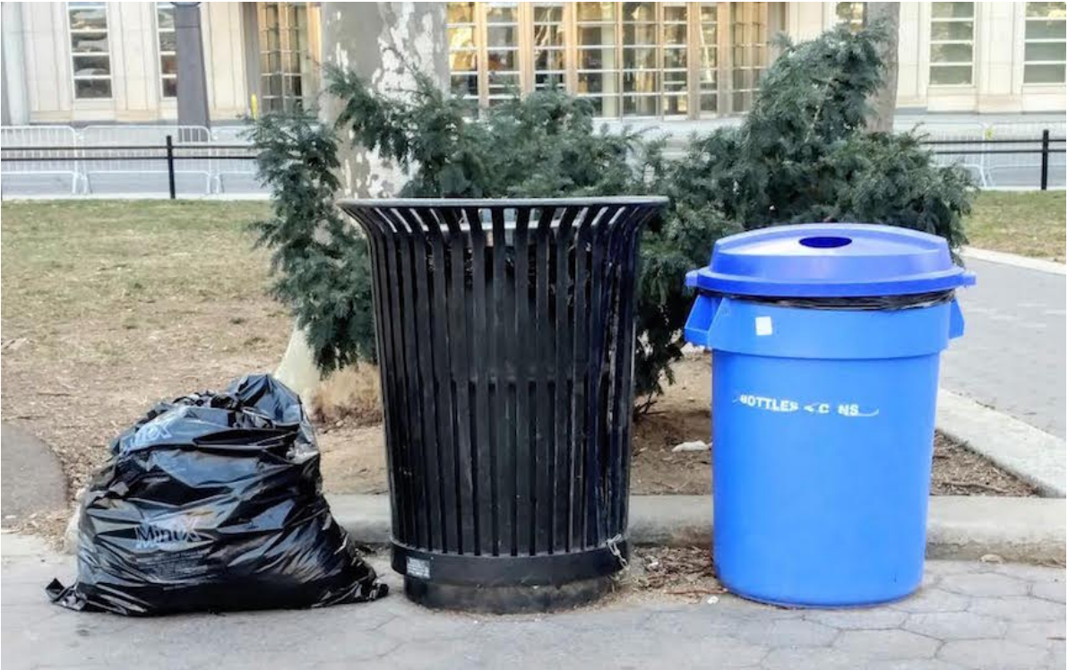
Certain Kinds of Trash, 2017