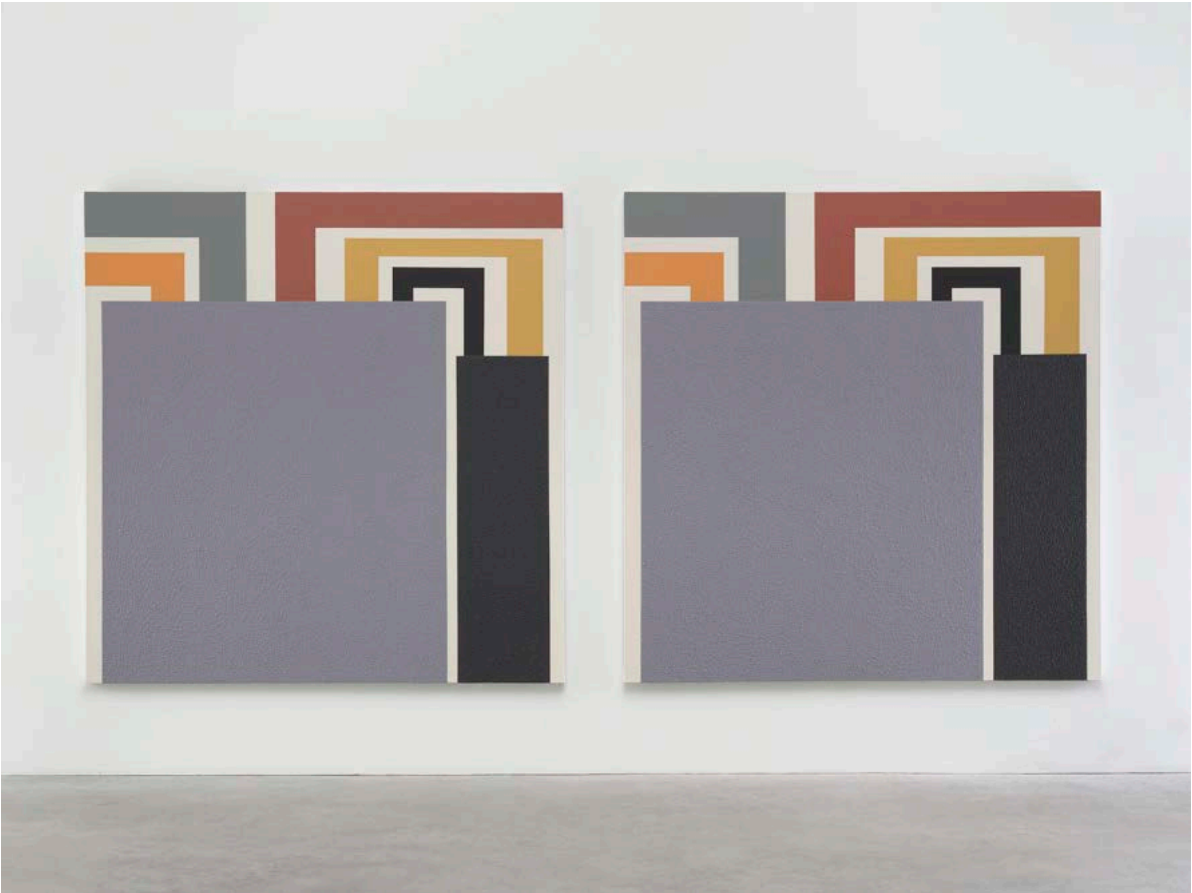
Adapter_Adapted, 2017 Acrylic and acoustic silicate on linen 78 x 144 inches