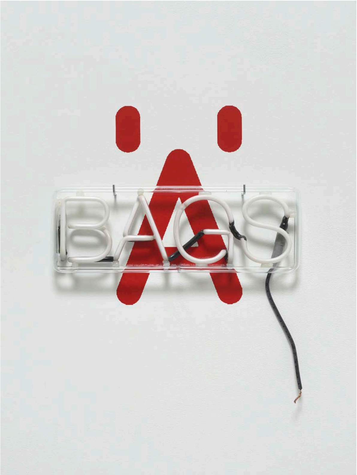
BAGS , 2017 Vinyl, glass, aluminum, copper, and rubber