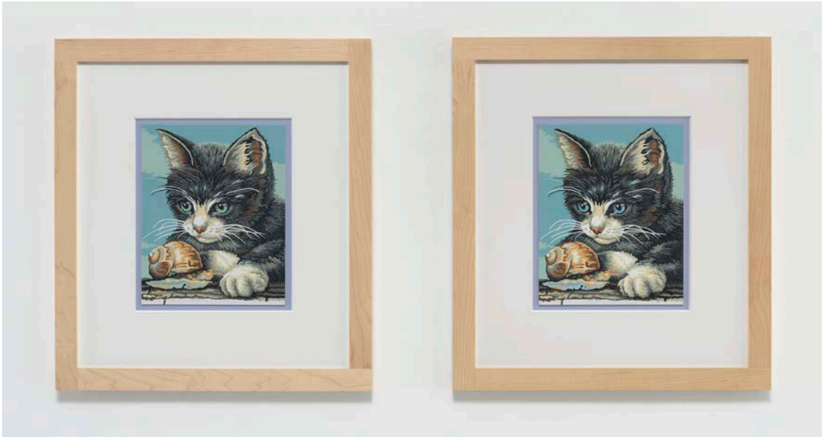
Oh It's The Last Time / Oh It's The Last Time, 2017

Acrylic on board with maple framing in two parts