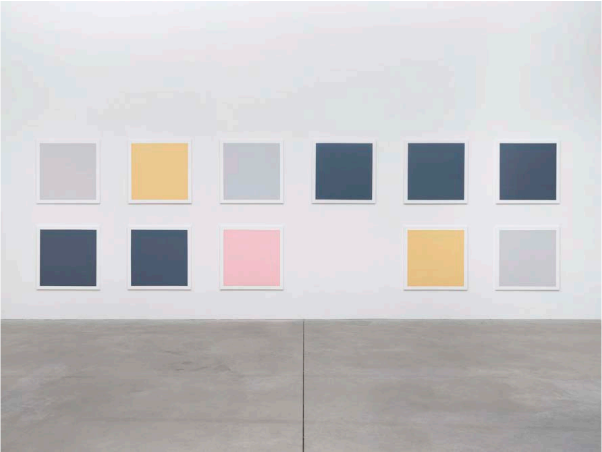
The Faculty of Mimesis, 2017