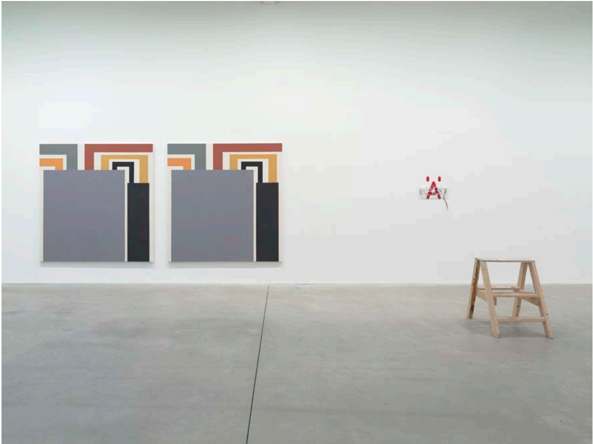
Adapter_Adapted & etc., 2017