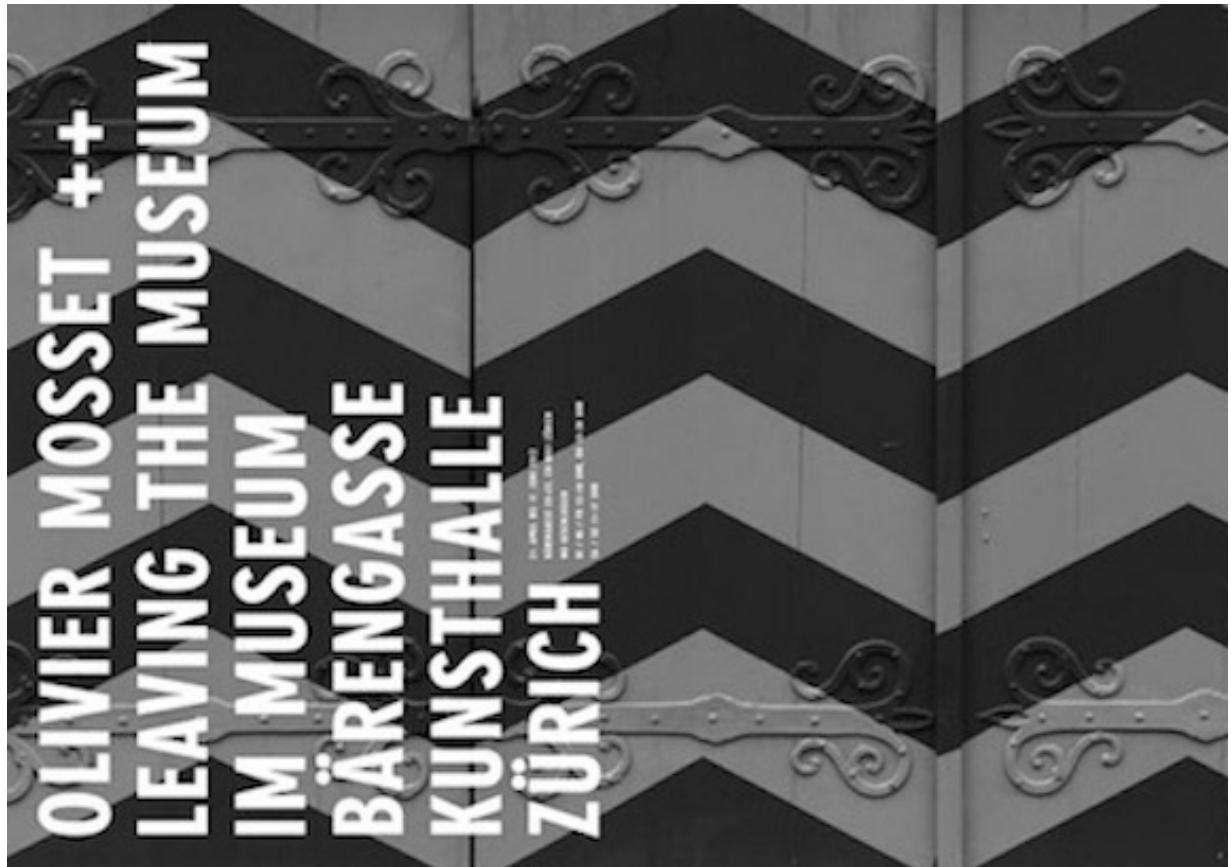
Olivier Mosset ++Leaving the Museum , 2012 Museum Barengasse, Kusthalle Zurich Exhibition poster

From ++ Leaving the Museum Olivier Mosset at Kunstshalle Zurich Museum Barrengasse April - June 2012